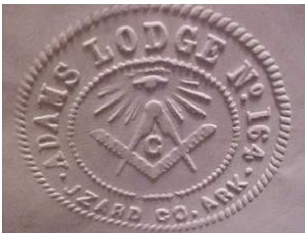
Adams Lodge Seal

The lodge building was not completely finished when the Civil War started and the contractor, together with many of his lodge brothers departed for military service. Almost every member of the Lodge served in the Confederate Army. Meetings were held in the building by early 1861 and continued until the lodge was moved to Norfolk. Two years of lodge minutes are missing, and the lodge may not have met with so many of its members in service. The lodge minutes do not reflect on the Civil War directly but make reference to "unsettled conditions" as the reason for not sending the mandatory annual delegate to the Grand Lodge in Little Rock which was in the hands of the Federal forces at that time.