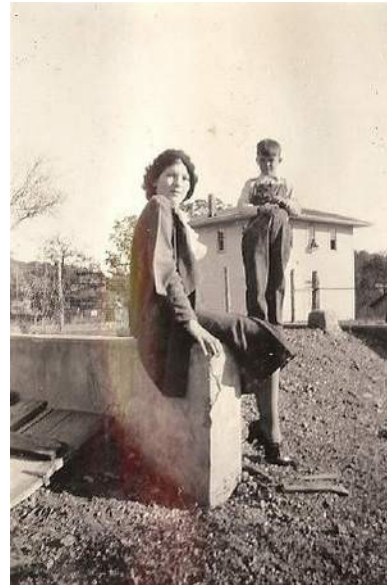
Adams Masonic Lodge circa 1937