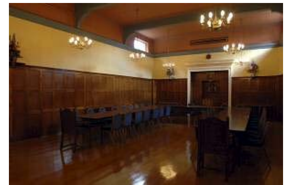
A peek inside one of the rooms at the hall