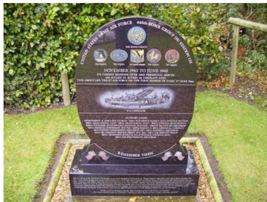
446th Bomb Group Memorial Flixton England