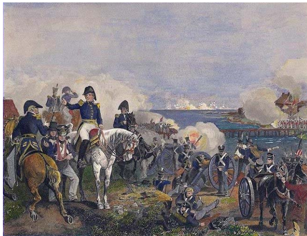
Gen. Alexander Macomb at the Battle of Plattsburgh.

http://nymasons.org/2015/battle-of-plattsburgh-1812/